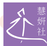
Wai Yin Society