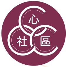
Chinese Community Centre Birmingham

Click the logos to go to each organisation's website