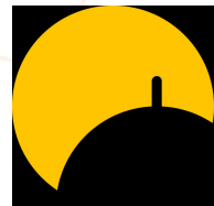
Hong Kong Umbrella Community