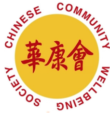
Chinese Community Wellbeing Society